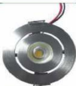
Downlight 1W (NB)