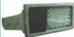
Street Light 54W (NB)