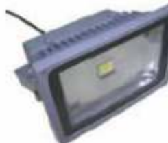
Flood Light (10/30/50/80W)