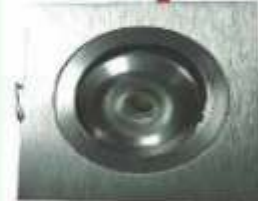
Downlight Square 1W (NB)