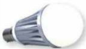
Bulb - 5 & 7W