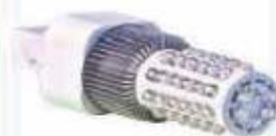
LED PL - 4-8W