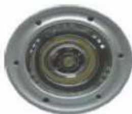
MR - 16 1W (WB)