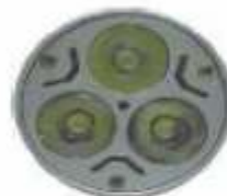
MR - 16 3W (NB)