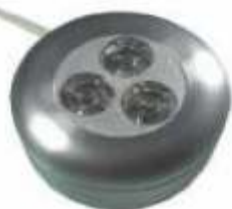
Surface Light 3W (NB)