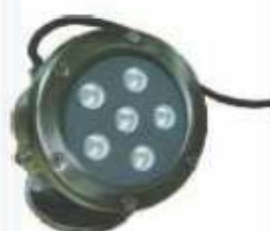
Underwater Light (6W)