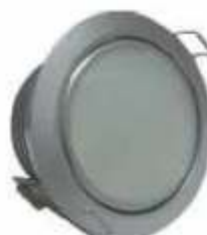
Downlight 6W (Pearl)