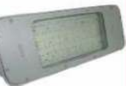
Floodlight (60W - 90W)