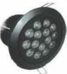
Downlight 15W (NB)