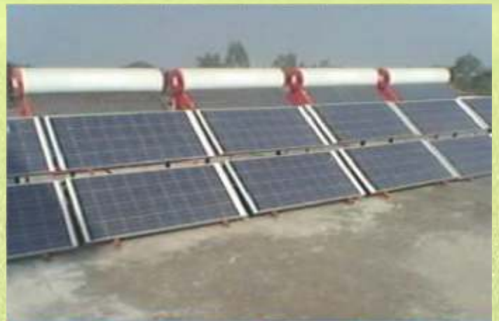
Solar Power Plant