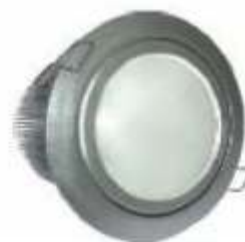
Downlight 9W (Pearl)