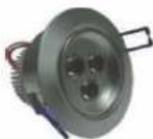
Downlight 3W (NB)