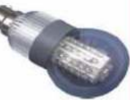
Bulb - 4W