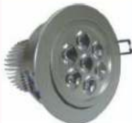
Downlight 7W (NB)