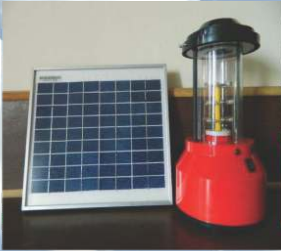
Solar Digital Inverter 48/12 LED

Backup Time: 10 - 12 hrs. Panel 3 Watt Charging AC/DC Both Battery 6V/4.5 Ah Night lamp & Mobile charging facility