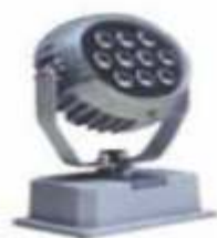
Focus Light (10W)