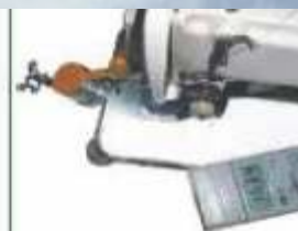
Sewing Machine Light