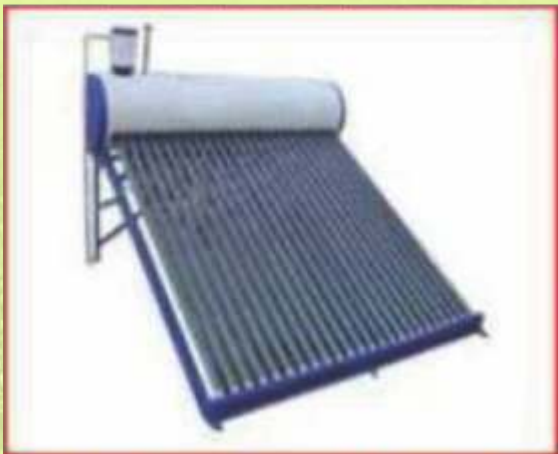
Solar Water Heating System