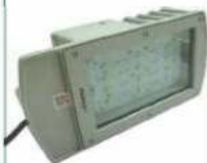
Street Light (6, 9, 12W)