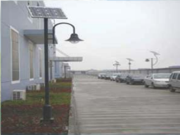
Solar LED Garden Light