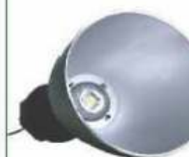
Highbay Dome (100W)