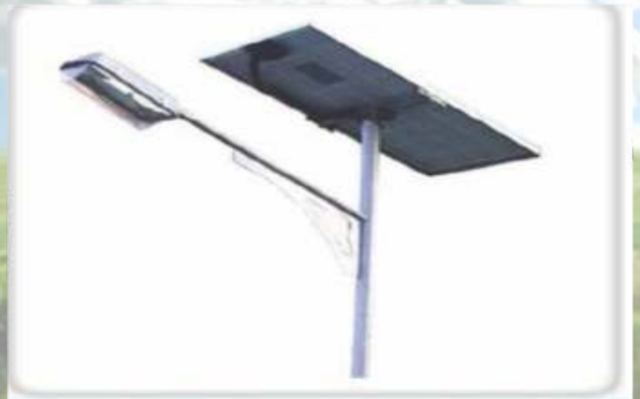
Solar Street Light LED/CFL