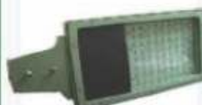
Street Light (60-90W)